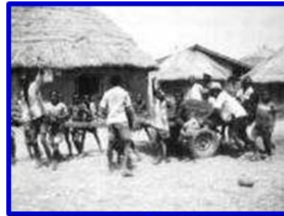
African Villages in: Tanzania, 1986 Ghana, 1988

Schafer, A., and D. Victor (2000). The future mobility of the world population. Transportation Research A , 34(3): 171-205 ( http://dx.doi.org/10.1016/S0965-8564(98)00071-